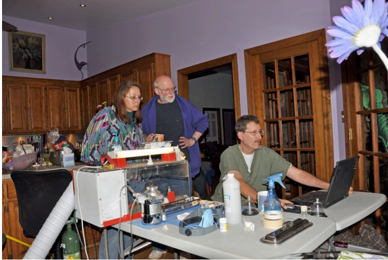
Picture: Updating a record on my laptop computer.

An example of a pet bird's record is included below. Also shown is a copy of a surgical sexing record sheet.